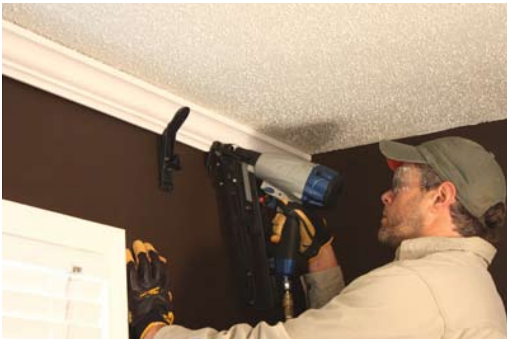
A pneumatic nailer can greatly speed up the fastening process.

Requiring no angled cuts, the first piece of molding is the easiest to install. Simply make a 90-degree cut to trim the molding to length, using a powered miter saw or handsaw and miter box. Use finish nails to fasten through the molding and into the wall and ceiling framing. A hammer and nail set will suffice, but be careful not to bang up the molding profile. A better tool for the job is a pneumatic nail gun, which frees up one of your hands, affords greater nailing precision and really picks up the pace of the installation.