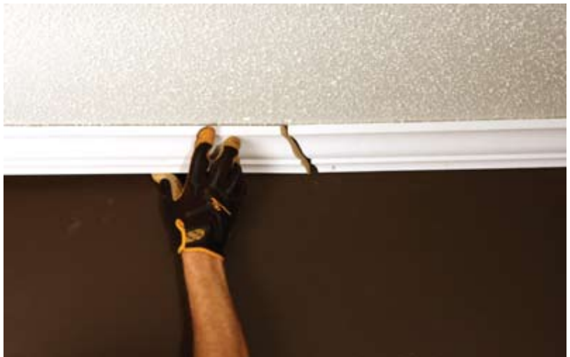
Cut scarf joints to join straight pieces of molding in a continuous run.

With the molding solidly fastened in place, fill the nail holes and seal seams with a high-quality caulk or wood filler. The molding used in this material was pre-primed pine. If you're painting the molding, it improves paint adhesion to sand the caulk after it dries and to “spot” prime the seams and nail patches. Once the primer dries, simply mask off the molding and finish up with a couple of coats of your favorite interior paint—we recommend using the high-gloss variety.