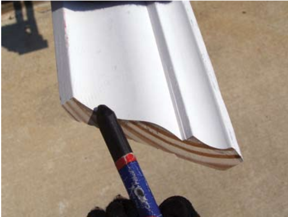
Use a pencil to darken the edge of the profile for better visibility.