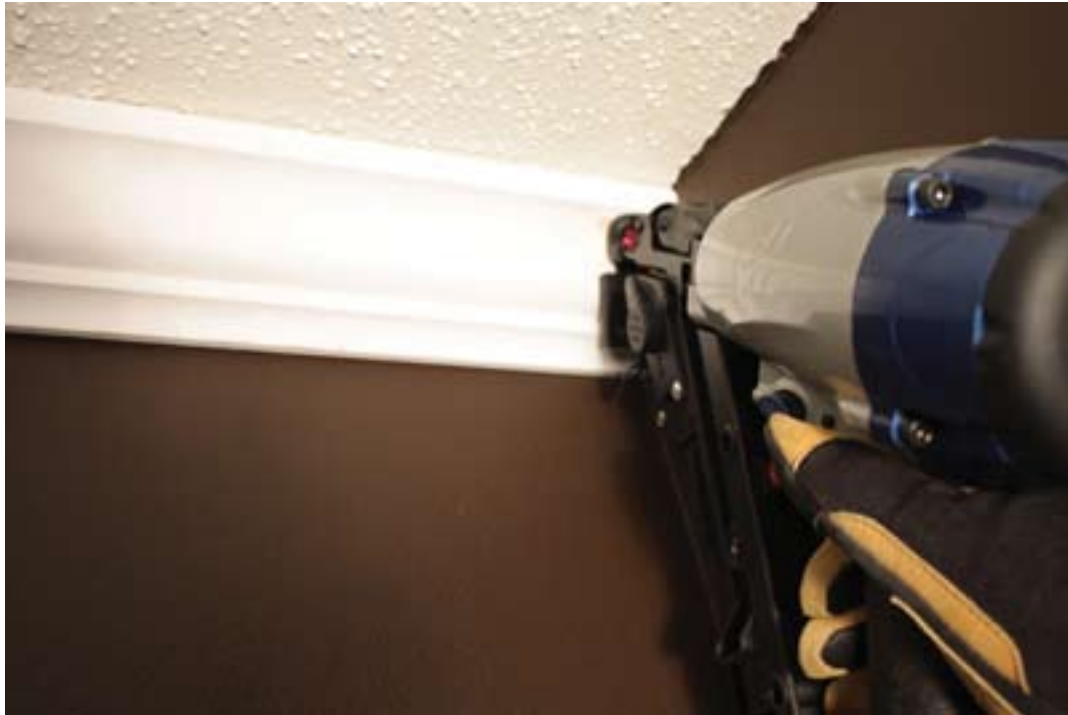
Campbell Hausfeld's new 15-gauge finish nailer features a laser marker to indicate exactly where the nail will be driven, as well as an integrated stud finder at the tip of the gun.