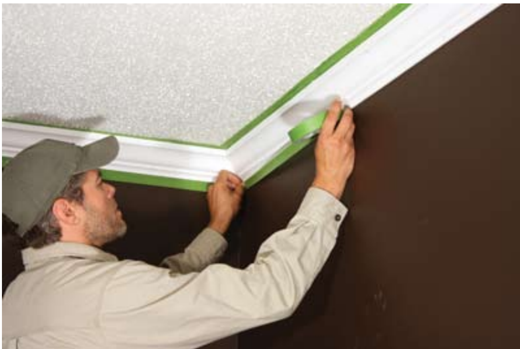
Mask off the molding with a quality painter's tape.