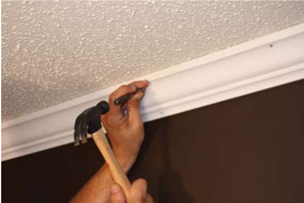
Set all nail holes below the surface of the molding and fill with caulk or wood putty.