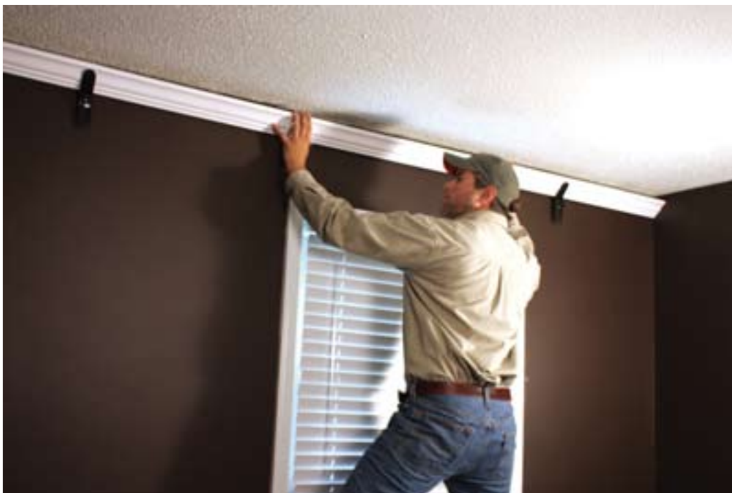
Temporary molding hangers can make installation easier.