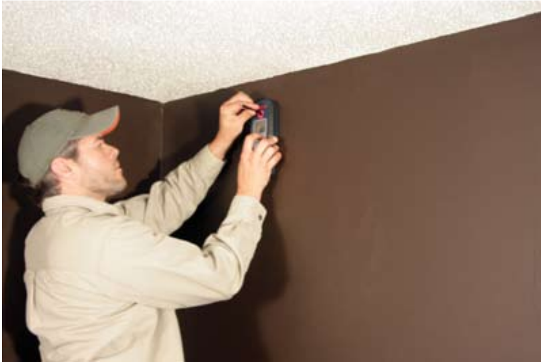
First step is to use a stud finder to mark the framing locations on the wall and ceiling.