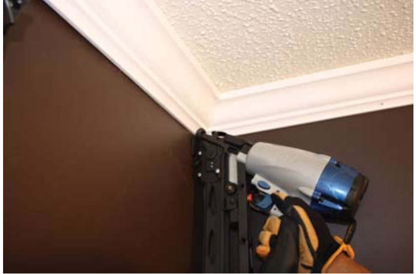
Nail the molding securely near the joint and into the stud framing.

The final molding strip on the fourth wall, above the door, is coped at both ends. Admittedly, it is difficult to successfully fit a piece of molding that is coped at both ends—even for a pro. To make this easier, you can fit each coped corner on a separate piece of molding and cut a scarf joint to join the two pieces in a continuous run. In fact, use a scarf joint anytime you need to join two pieces of molding along a straight run of the wall. To make a scarf joint, cut opposite miters on the two molding pieces and nail the joint securely over a wall stud. After fastening the first half of the run over the stud, cope the corner end of the second half and then cut a supplementary miter, making the strip just a little too long. Test-fit this last piece and then cut away the excess on the miter until it fits snugly into the scarf joint with no visible gap.